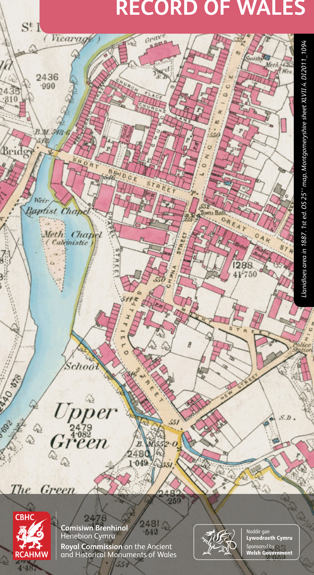
Llanidloes area in 1887. 1st ed. OS 25' map, Montgomeryshire sheet XLVII.4. DI2011_1094