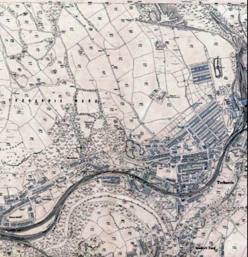
Treharris area in 1919, shown on the 2nd edition OS 25'' map. D12012_0326