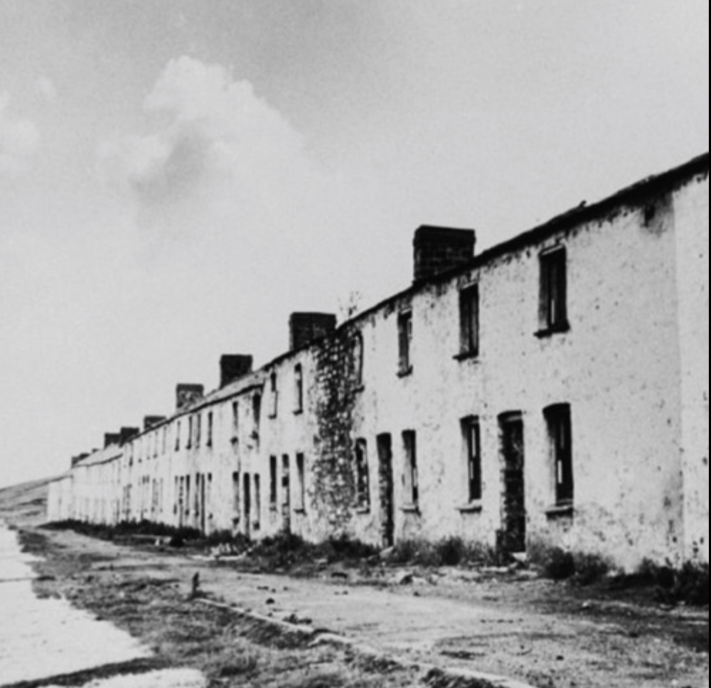
Back Row, Onllwyn: two-storey workers' cottages, now demolished. DI2008_1332 NPRN 407800